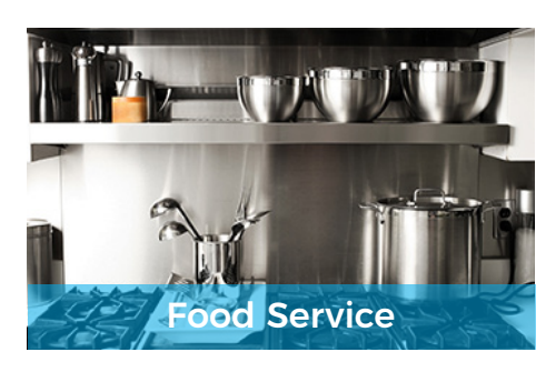
All products used in the cleaning and sanitizing of kitchens in restaurants, cafeterias, cafés, and other food service environments.

Alpha manufactures cleaning and sanitizing products for facilities processing a wide variety of food and beverages: bakeries, beef, beverage, brewery, dairy, pork, poultry, produce, ready-to-eat, seafood and winery markets.