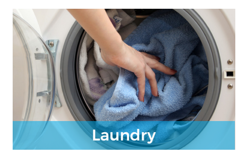
We offer a complete line of commercial laundry products and can custom blend unique formulations. Our wide range of batching capability allows us to supply any size you need from pails to bulk shipments.

Professional cleaning solutions for all custodial needs. Products available either as a concentrate or ready-to-use formulation.