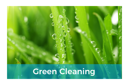
Environmentally preferred cleaning solutions for industrial, institutional and retail markets.